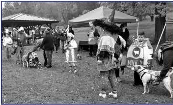
2017 Pooch Parade

SPECIAL THANKS TO OUR SPONSORS, VOLUNTEERS AND DONORS FOR THIS YEAR'S