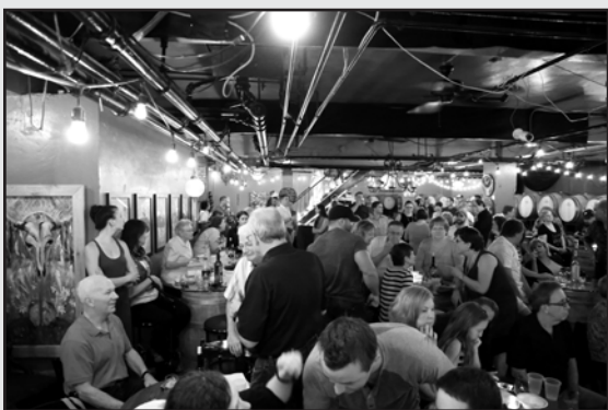
The standing-room only crowd at Who's Your Daddy