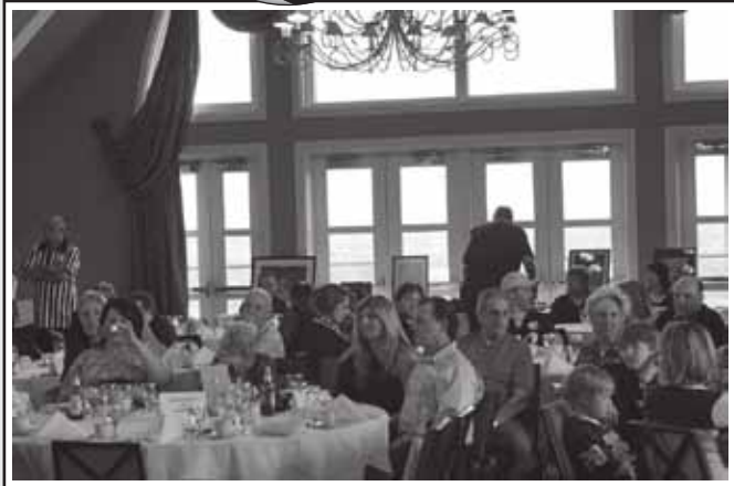
A beautiful crowd in a beautiful setting!