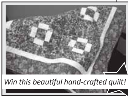
Win this beautiful hand-crafted quilt!