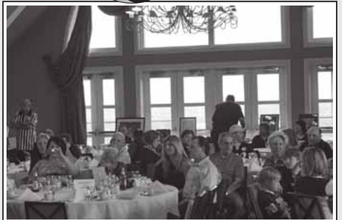
A beautiful crowd in a beautiful setting!